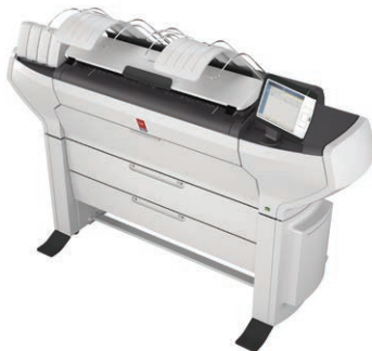
Océ ColorWave 3500 standalone

The Océ ColorWave 3000 can print on a wide range of media, enabling a wide range of applications – from high-quality technical documents to full colour graphics. With a media capacity of up to 6 rolls, the Océ ColorWave 3700 model enables you to productively mix applications or to run large jobs without interruption. Additionally the Océ ColorWave 3700 model exclusively offers Océ MediaSense technology that automatically adjusts the gap between the imaging device and media, for high- quality output without manual adjustments. Océ MediaSense technology provides the ability to grow application volumes for a faster return on investment. The versatile Océ CrystalPoint printing technology offers instant-dry prints with no feathering and excellent fine detail on a variety of media types, from thin, uncoated paper to vinyl. The Onyx workflow support helps you to easily fit the Océ ColorWave 3000 series into your graphic arts workflow.