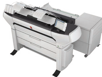
Océ ColorWave 3700 with Océ Folder Express 3011