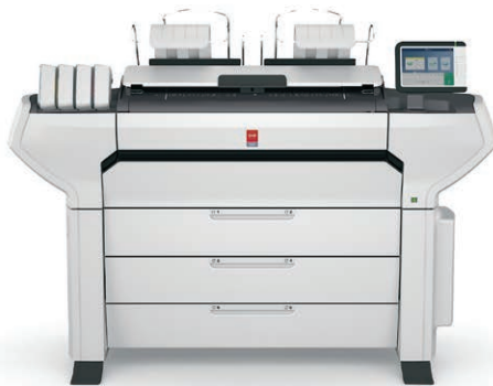
Océ ColorWave 3700