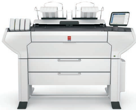
Océ ColorWave 3500

The Océ ColorWave 3000 series comes in two models: The Océ ColorWave 3500 for worry free walk up printing, while the Océ ColorWave 3700 targets customers requiring higher media capacity and media versatility.