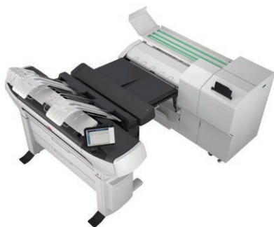
Océ ColorWave 3700 with Océ Folder Professional 6013