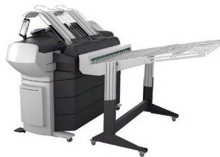
Océ ColorWave 3700 with Océ Stacker Select